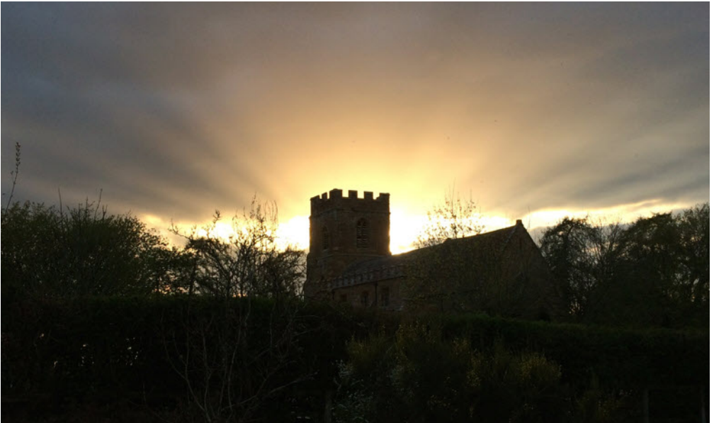
A beautiful sunset over St Lawrence's Church.